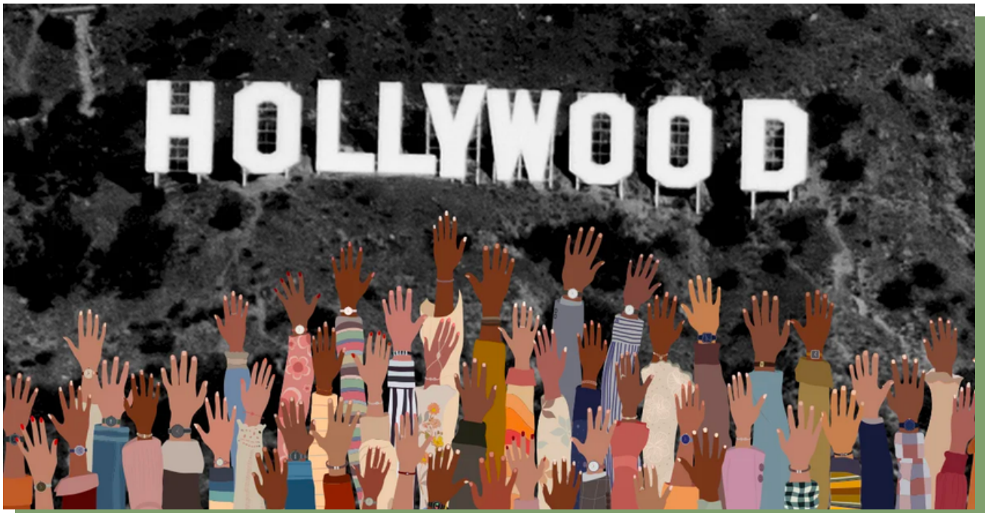
used in the article on WRAP PRO (July 17th 2023)

And truly, now that we have an image of Princess Tiana ( The Princess and The Frog ) in our heads, or of Esmeralda ( The Hunchback of Notre Dame ), how would we feel about a white actress in those roles? Most recently, Disney has faced backlash over casting Latina actress Rachel Zegler as Snow White. The backlash was so intense that she is now being replaced. Also, in the works “Peter Pan and Wendy” with black actress Yara Shahidi playing the iconic blonde Tinkerbell. The effect of this new agenda, specifically on Gen Z, should be noted.