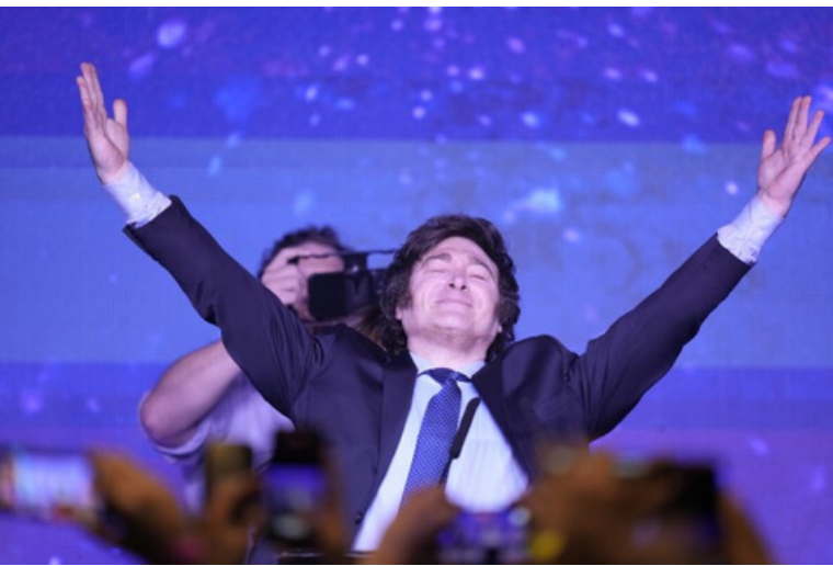
Javier Milei winning the elections in November 2023.

Javier Milei defeated Sergio Massa in a balloting with a turnout of more than 25 million people, which amounts to around 77% of the Argentinian citizens allowed to vote.