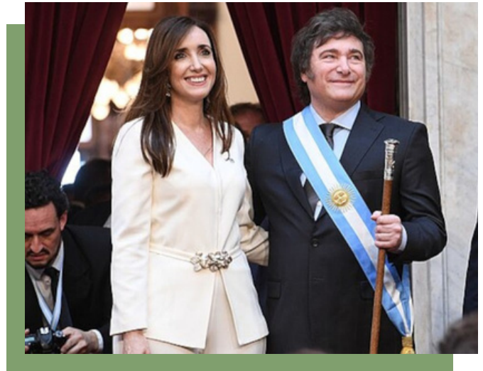
Javier Milei and his new vice president, Victoria Villarruel.

Adding to this, elected Vice President Victoria Villaruel has publicly supported lifting the ban imposed by former President Raúl Alfonsín after the military dictatorship. This law prohibits the Armed Forces from taking part in operations related to security within the territory of the Nation.