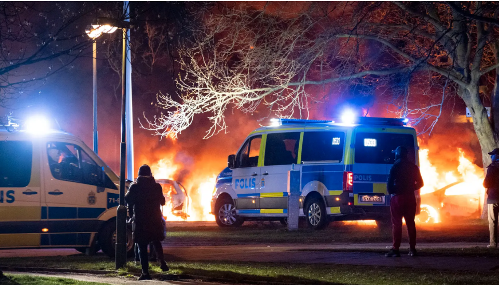
Stavanger Aftenblad (April 19th 2022): Cars are on fire at Rosengårdsskolen in Sweden.

THE SWEDISH MINISTER OF JUSTICE HAS EXPRESSED HIS CONCERNS FOR THE SAFETY AND WELL-BEING OF THE SWEDISH PEOPLE, AFTER A GROWING WAVE OF VIOLENCE, THAT IS CONNECTED TO A GANG RIOT IN A CRIMINAL NETWORK FOXTROT OCCURRED/SPREAD THROUGH THE COUNTRY.