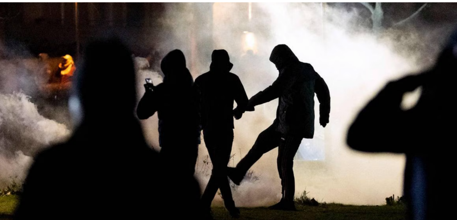
NRK (September 10th 2022): Riots breaking out in Sweden amongst gang movements.

They have promised stricter penalties and more surveillance. They are also pushing for increased investment in social services and the school system. However, there is still a long way to go and it will take some time for the situation to resolve.