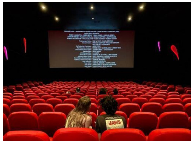
Ministère de la culture (October 26th 2022): Movie theater

Many are enjoying the refreshing representation changes in cinema. According to Zippia, in 2023 32.5% of Hollywood actors are female, which is a good start with their other statistic showing that 13.2% are black — corresponding with the US's 13.5% African American population. Additionally, reports from the UCLA social sciences study show that “People of colour accounted for 21.6% of the leads in top theatrical films for 2022.” This is great news on many fronts. While some deem the representation to still be insufficient, there is also an appreciation for the progress made — though it fluctuates.