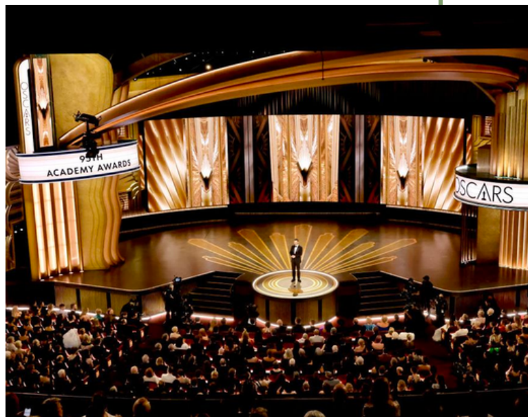
House beautiful (March 12th 2023): The Oscar's Stage 2023

THE ISSUE OF REPRESENTATION DIVIDES THOSE WHO WANT IT AND THOSE WHO DON'T. NEVERTHELESS, THE TWO MAJOR SUBGROUPS WITHIN THOSE WHO VALUE IT DIFFER IN THE METHOD IN WHICH THEY WISH TO SEE THIS REPRESENTATION.